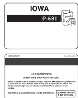
P-EBT card front and back

If you have a child who is eligible for the Free and Reduced Price School Meals, the P-EBT benefit will be mailed to the address on file with the school district.