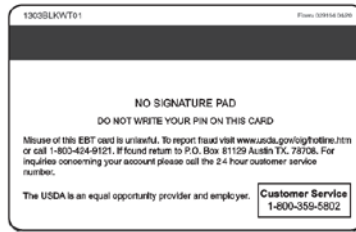
Card front and back